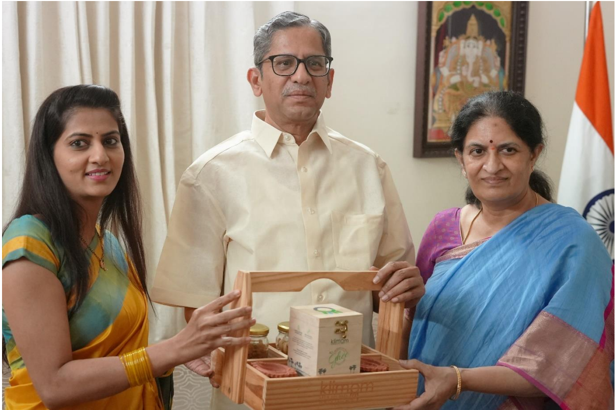
Honourable Former Chief Justice of India - Sri N.V.Ramana Garu