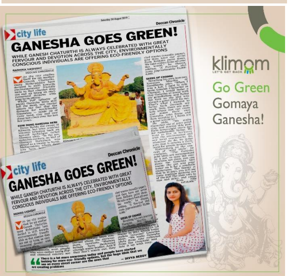
Go Green Gomaya Ganesha!