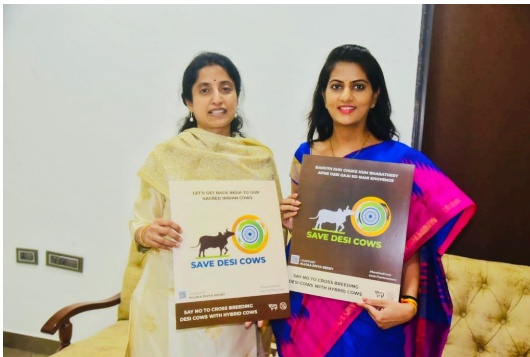
Smt Y.S. Bharathi Reddy garu - W/O Honourable Chief Minister of Andhra Pradesh