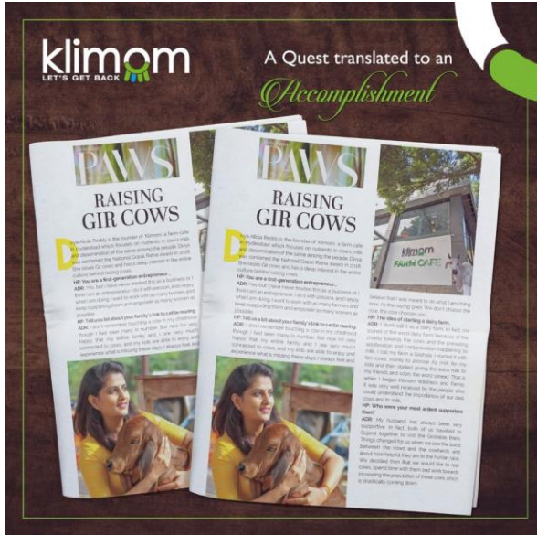
A Quest translated to an Accomplishment