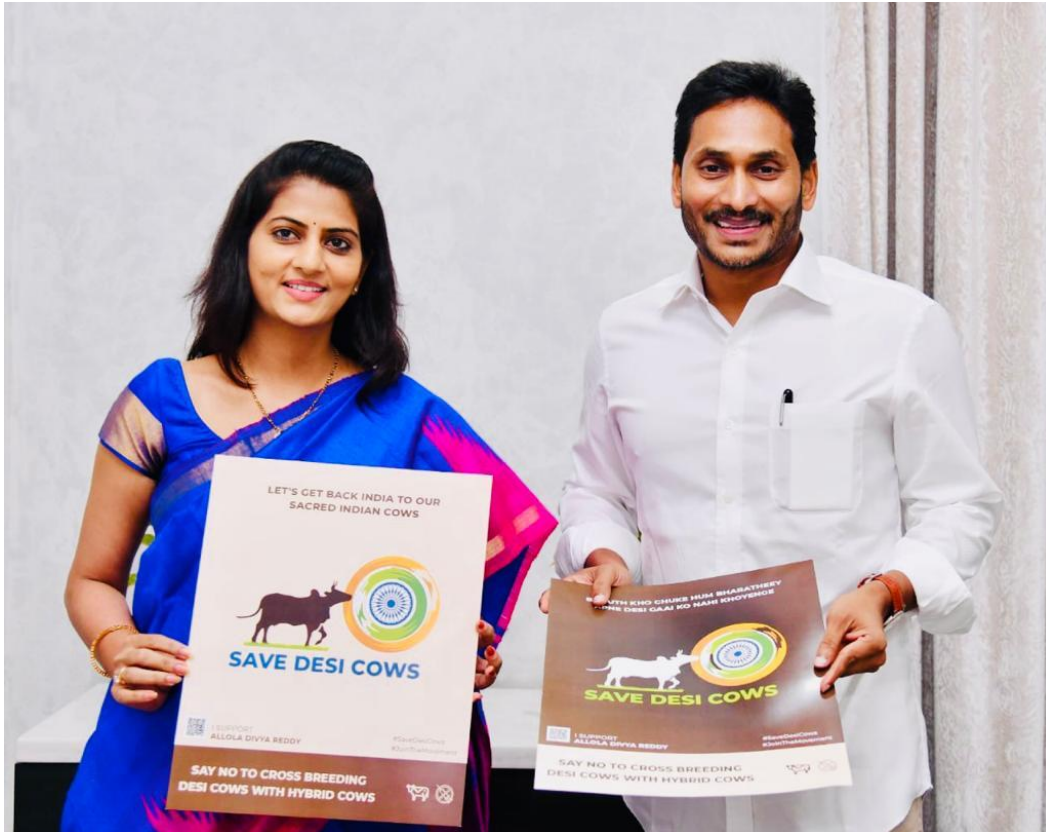
Honourable Chief Minister of Andhra Pradesh - Sri Y.S. Jagan Mohan Reddy garu

Divya seeks the support of the respected Government Office bearers of the country to bring change in the breeding policies.