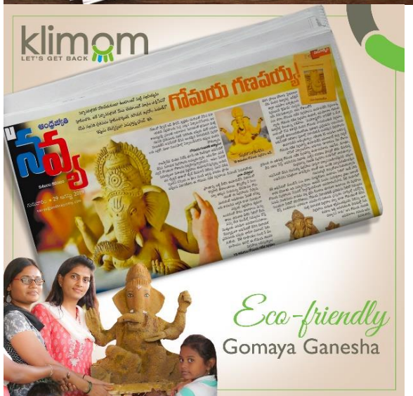
Eco-friendly Gomaya Ganesha