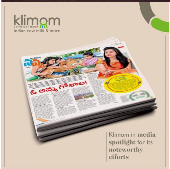
Klimom in media spotlight for its noteworthy efforts