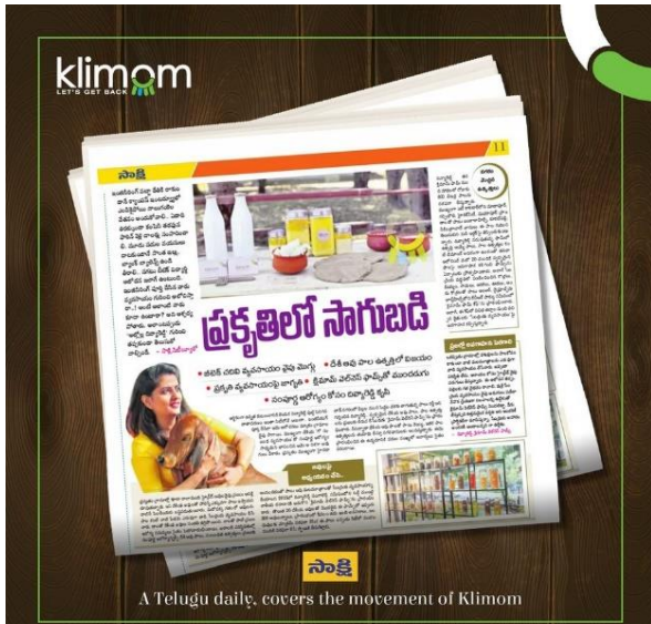
A Telugu daily, covers the movement of Klimom