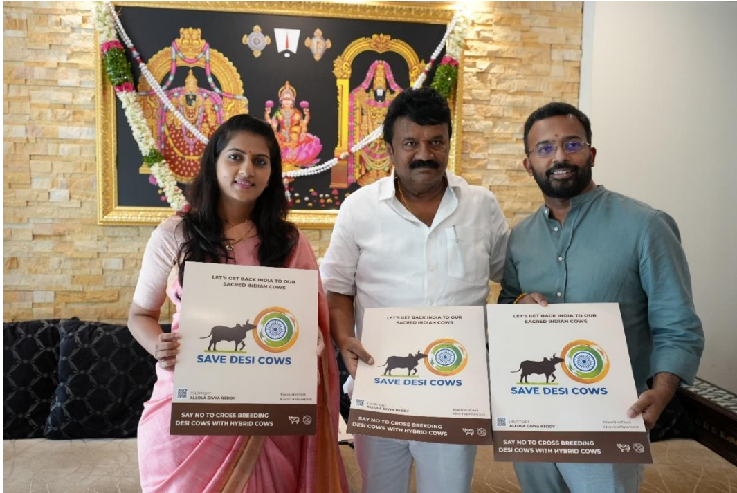
Honourable Animal Husbandry Minister of Telangana - Sri Talasani Srinivas Yadav garu